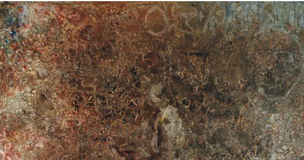
Derek Hill: Untitled , (2009) (detail), the FLAW series.